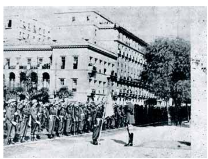
The Greek Expeditionary Army receives the flag from king Pavlos short before the departure for this "mission of shame" in Korea

The imperialistic intervention in Korea came under the formal cover of the Organization of the United Nations. The USA, handling in their favour the absence of the USSR's representative in the Security Council, accomplished a resolution that imputed to North Korea the outbreak of the war and approved the military intervention - under the umbrella of the United Nations - in favour of Lee Seung-Man's (Syngman Rhee) regime. For the last six months, USSR was not participating in the meetings of the Security Council in order to protest against the fact that the seat, which rightfully belonged to the representative of the government of People's Republic of China, was provocatively occupied by a "representative" of the deposed prerevolutionary regime of Chiang Kai-shek.