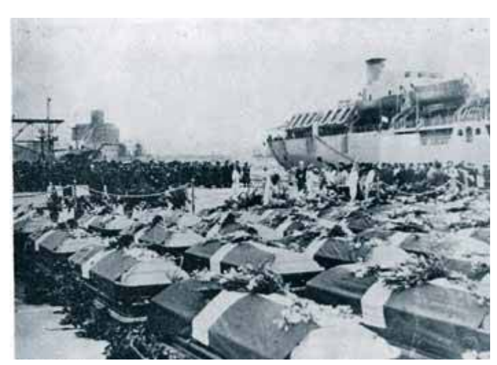
Dozens of coffins in the harbour of Piraeus (Greece). This was the "profit" fom Greece's attendance in the Korean war

In the imperialistic intervention in Korea took part 21 countries, and one of them was Greece<sup>10</sup>.